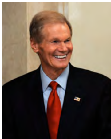
U.S. Senator Bill Nelson

If you have any strong thoughts on what direction we need to be heading, I highly recommend you have September 5, 2012 on your calendar. Senator Bill Nelson is heading our way to share a light lunch, his thoughts and ideas, and to respond to what is on your mind. Senator Bill Nelson is a true son of Florida; his family came to Florida in 1829; his grandparents homesteaded in the early 20th century on land that today is the Kennedy Space Center. Most of us have a