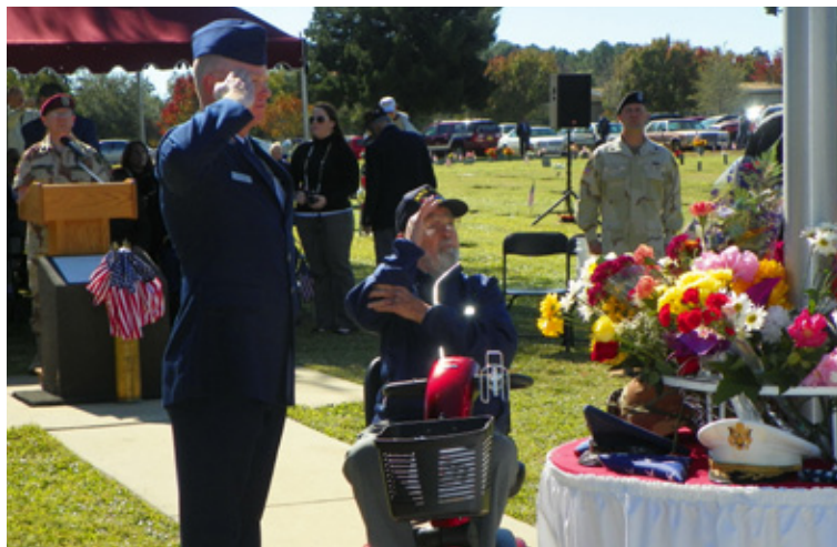
Veterans Day 2011 at Beal Cemetery