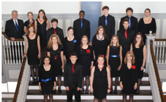
Opus One in front of the Old Historical Capitol in Tallahassee