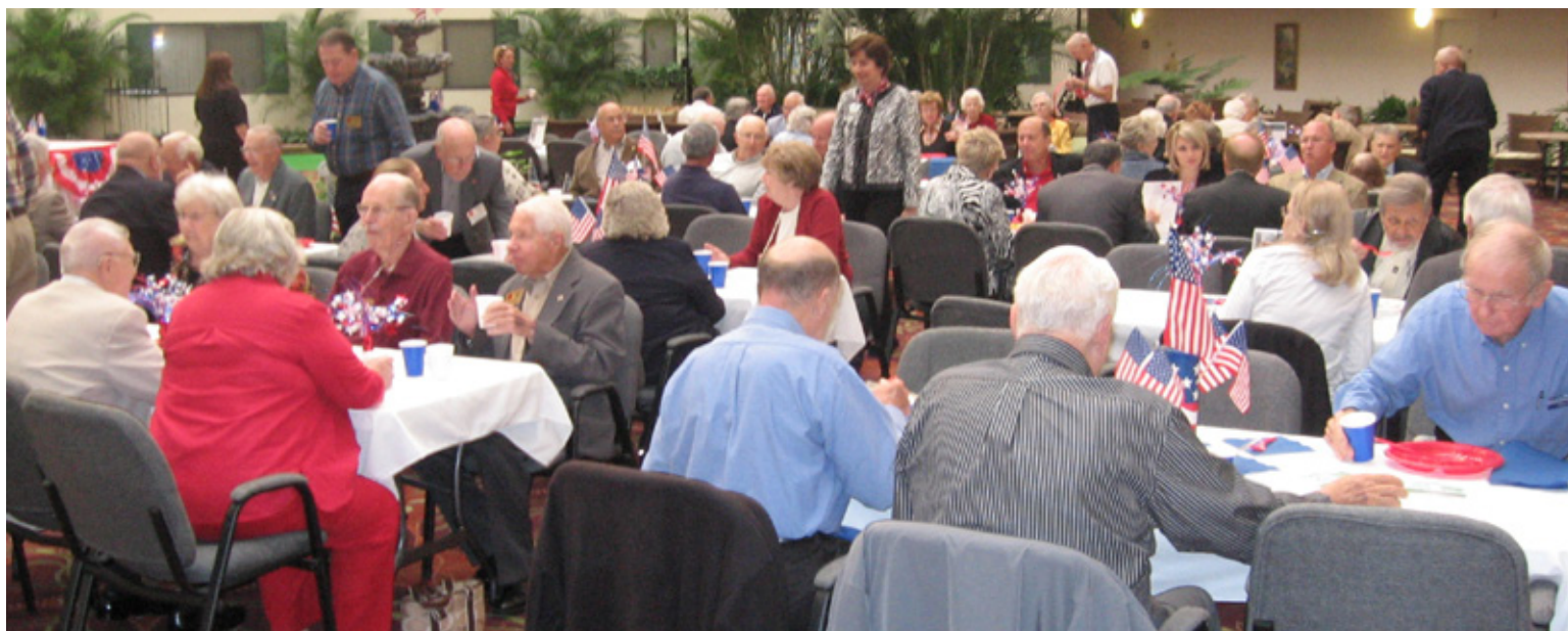
Nov Breakfast At Westwood