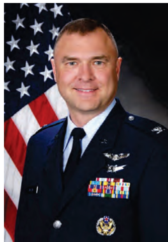
Col Gaary Haase, Commander, Munitions Directorate, AFRL

of affordable warfighting conventional air-launched weapon technologies for the U.S. Air Force. The activities of the Munitions Directorate include research on missile seekers, navigation and control, image processing, munitions integration, warheads, fusing, explosives and technology assessment methodology.