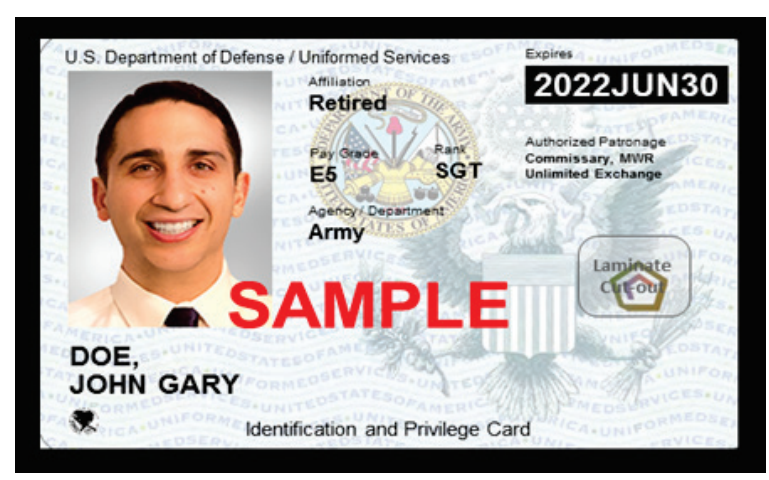
A look at the Next Generation Uniform Services Identification Card.

According to Pentagon data, 97% of the DoD's ID renewal offices, known as Real-Time Automated Personnel Identification Card System, or RAPIDS, sites worldwide are issuing the new cards, which more closely resemble Common Access Cards used by troops and DoD civilians.