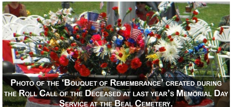
PHOTO OF THE ‘BOUQUET OF REMEMBRANCE’ CREATED DURING THE ROLL CALL OF THE DECEASED AT LAST YEAR’S MEMORIAL DAY SERVICE AT THE BEAL CEMETERY.

IMPORTANT NOTE: The services at Beal Cemetery will start at 10:00AM this year instead of 11:00AM. I ask that all NWFMOA members and spouses in attendance join us at the flag pole when our organization is called for a ‘memorial salute’ and place a flower in the bouquet at the base of the flag pole. Flowers are provided.