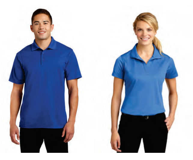
Examples of Polo Shirts without MOAA Logo

Contact Dan Brown brownaandd@hotmail.com or 651-0005 to order. Send check $34 for each shirt to Dan Brown, 60 Lake Lorraine Cir, Shalimar, FL 32579. Shirt will not be ordered until check is received.