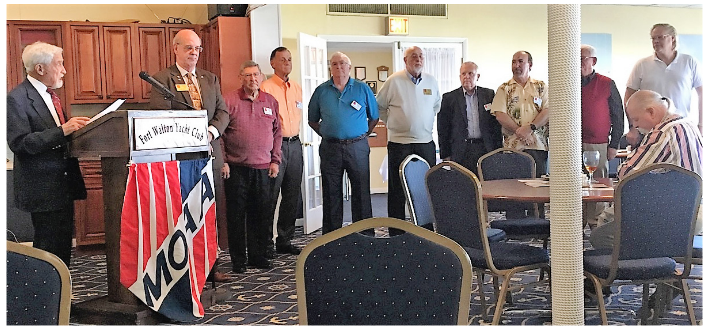
Swearing in of the 2017 Officers of NWFLMOA