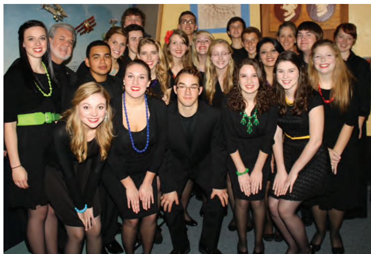
Niceville High School's Opus One