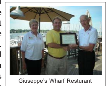
Giuseppe's Wharf Restaurant

Honor Roll certificate to last year's prize sponsors. We'll provide you with photos of those