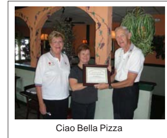
Ciao Bella Pizza

Hello, Everyone! I hope you're getting geared up for our Christmas Gala on the 16 th of December! Our Scholarship Committee elves have been out scouring the countryside to bring you great prizes