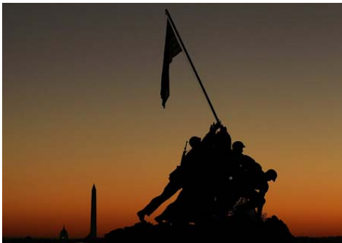
The sun begins to rise behind the U.S. Marine Corps War Memorial, also called the Iwo Jima Memorial, on Nov. 10, 2010, in Arlington.

“So long as that spirit continues to flourish Marines will be found equal to every emergency in the future as they have been in the past, and the men of our Nation will regard us as worthy successors to the long line of illustrious men who have served as “Soldiers of the Sea” since the founding of the Corps.” the message reads.