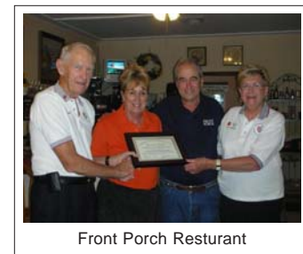
Front Porch Restaurant

as the case may be. -- And while you're there, please identify yourselves as members of NWFMOA, and let them know that you appreciate their support of our scholarship program. It's the least we could do to recognize their kind generosity!