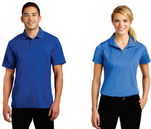
Examples of Polo Shirts without MOAA Logo

Contact Dan Brown brownaandd@hotmail.com or 651-0005 to order. Send check $34 for each shirt to Dan Brown, 60 Lake Lorraine Cir, Shalimar, FL 32579. Shirt will not be ordered until check is received.