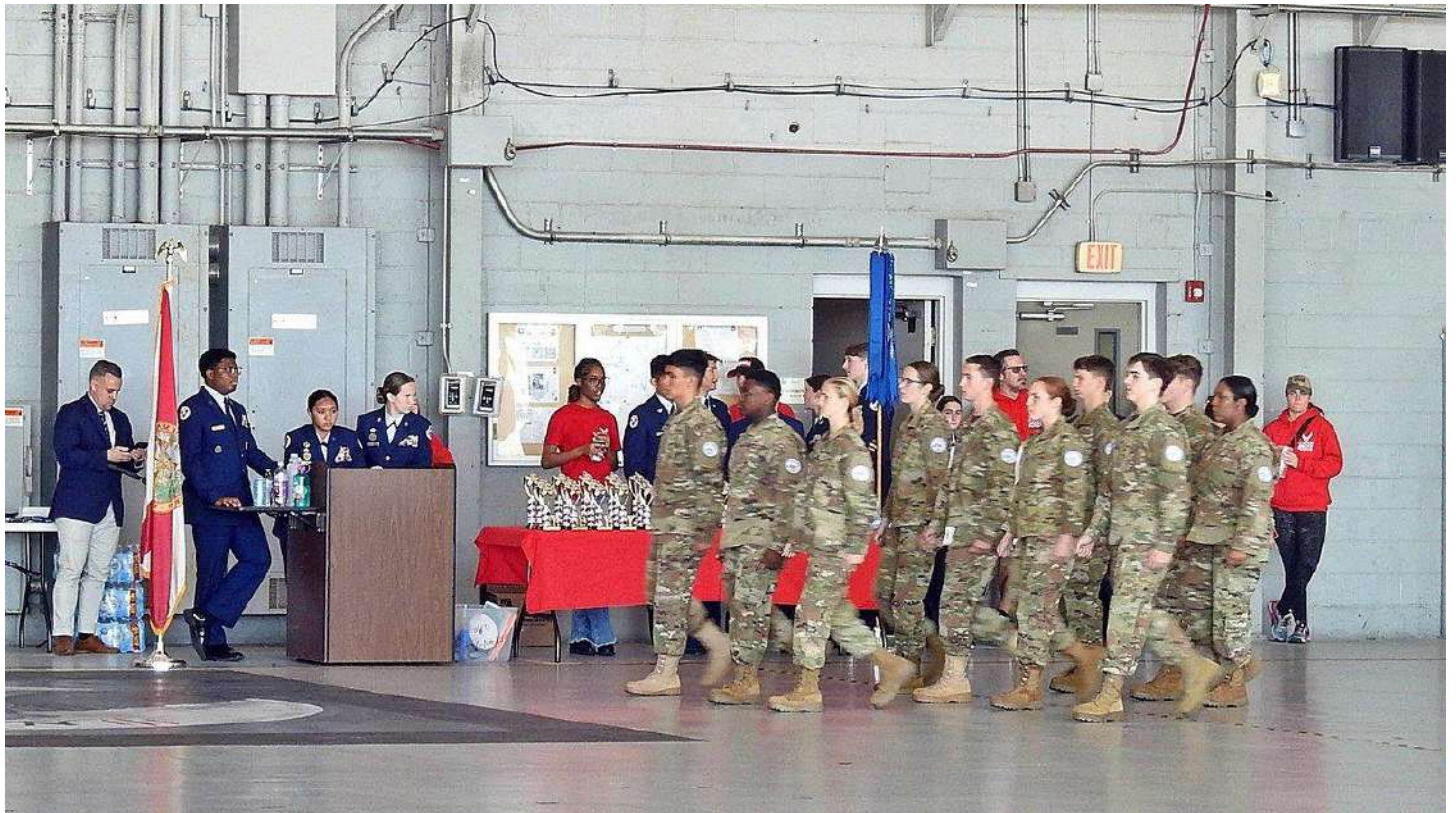
Cadets of the Niceville JROTC compete in the Close Order Drill event.