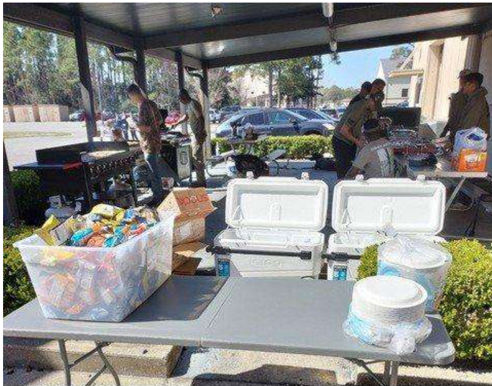
Food is being prepared for the Cadets following their Drill Competition.

Funding by NWFMOA provided the lunches for over 160 attendees at the Drill Competition. The burgers and hot dogs were grilled by members of the 8 th Aircraft Maintenance Squadron at Hurlburt.